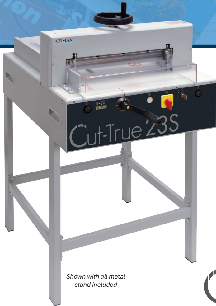
Shown with all metal stand included